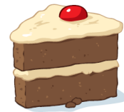
A small slice of cake