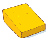
A match box size piece of cheese