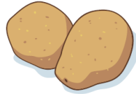
2 egg sized potatoes