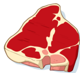
Hand sized portion of meat