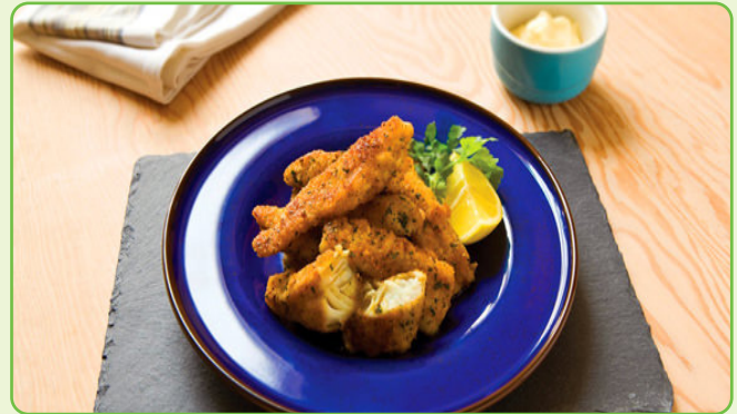
Recipe & image supplied by the Seafish Authority: www.fishisthedish.com

Add extra flavour to the flour or breadcrumbs with some crushed garlic or herbs, or maybe even a pinch of chilli flakes? Get creative!